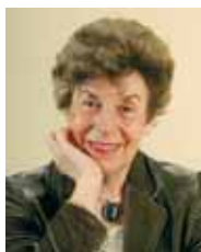
The Rt Hon Baroness Shephard of Northwold JP DL (d.o.b 22 January 1940)

Rt Hon Alun Michael JP MP was first elected to Parliament for Cardiff South and Penarth in 1987 and was appointed Deputy Home Secretary in 1997. In 1998 he joined the Cabinet as Secretary of State for Wales, and was elected Leader of the Labour Party in Wales in 1999. He was then elected the Founding First Secretary (First Minister) of the National Assembly for Wales, resigning in 2000 and going back to the House of Commons. He returned to Government in 2001 as Minister of State for Rural Affairs and Local Environmental Quality, and went on to become Minister of State for Industry and the Regions until May 2006.